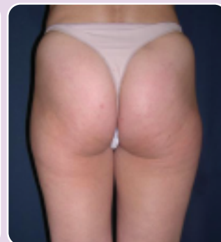
Outer thighs after Contour I Tx