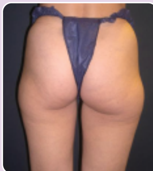
Outer thighs before Tx