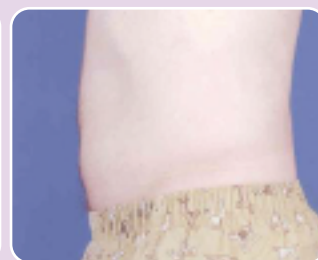
After three Contour I treatments

Dr. Polla — In our office the doctor selects patients and treatment areas, but treatments are performed by aestheticians under supervision.